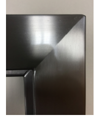
Grain long Direction Of Each Piece - Option