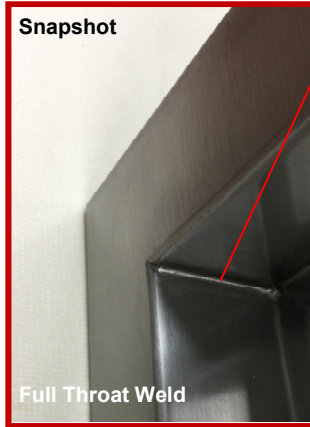
Full Throat Weld